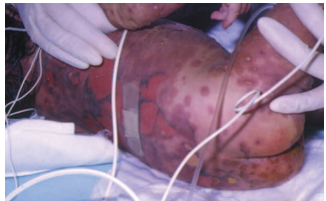
FIGURE 1 Typical pattern of TEN: skin detachment and atypical targets.

Sulfonamides, phenobarbital, carbamazepine, and lamotrigine were never concomitant to another highly suspected drug.