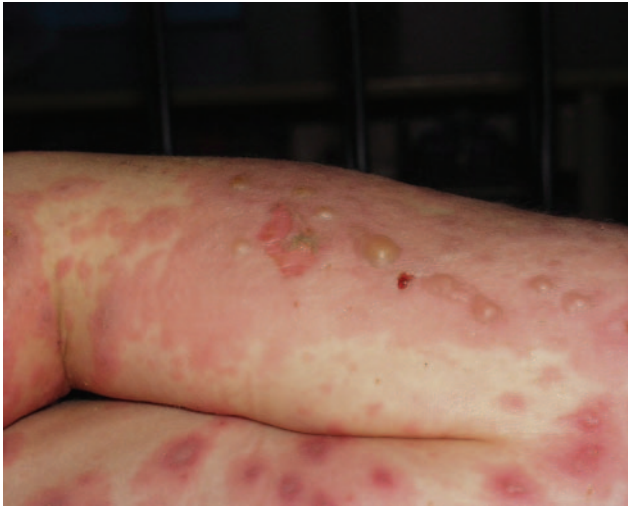
FIGURE 2 Typical pattern of SJS: blisters develop on widespread atypical targets.

mines were modestly increased, but the lower confidence limits were <1.0 .